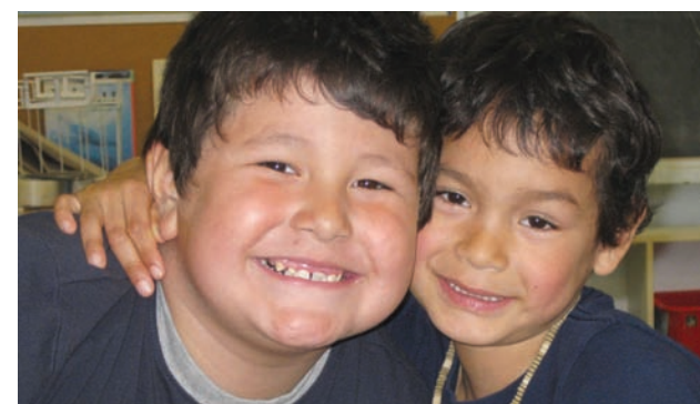
The report notes the need for special attention for Aboriginal children.